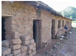
Conditions of many rural schools in Cameroon.

The North American Baptist Conference has worked along with the Cameroon Baptist Convention since 1936 to provide Christian education throughout Cameroon. The schools provide government approved education while teaching Christian and moral education to over 30,000 Cameroonians throughout the country. In 1970, NABC handed over school operations to the CBC Education Board.